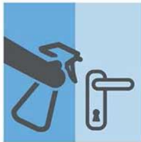
CLEAN AND DISINFECT "HIGH-TOUCH" SURFACES OFTEN