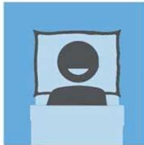
GET ADEQUATE SLEEP AND EAT WELL-BALANCED MEALS