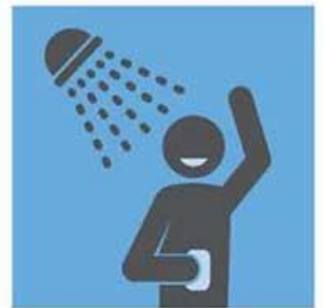
PRACTICE GOOD HYGIENE HABITS

For more information, visit: coronavirus.ohio.gov