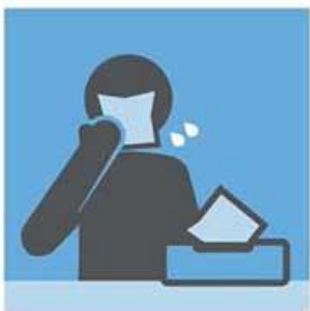
COVER YOUR MOUTH WITH A TISSUE OR SLEEVE WHEN COUGHING OR SNEEZING