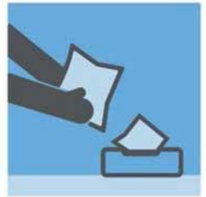
DRY HANDS WITH A CLEAN TOWEL OR AIR DRY YOUR HANDS