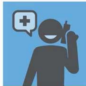
CALL BEFORE VISITING YOUR DOCTOR