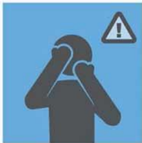
AVOID TOUCHING YOUR EYES, NOSE, OR MOUTH WITH UNWASHED HANDS OR AFTER TOUCHING SURFACES