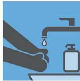
WASH HANDS OFTEN WITH WATER AND SOAP (20 SECONDS OR LONGER)