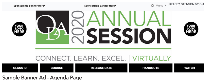
Sample Banner Ad - Agenda Page