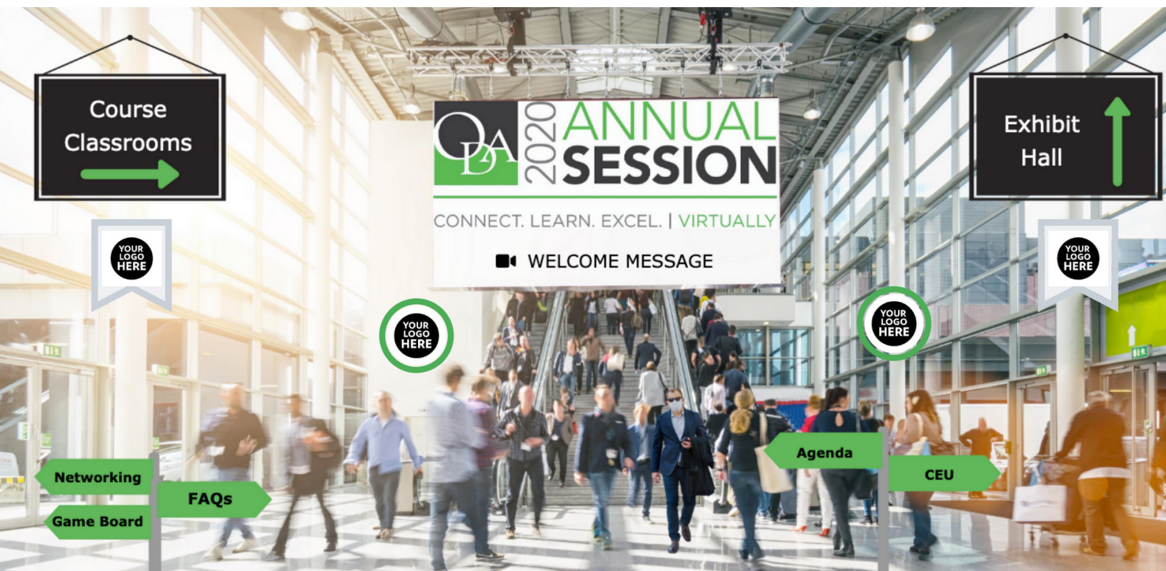
Exhibit at the 2020 ODA Virtual Annual Session!

The ODA Annual Session has gone virtual this year, and we have provided a unique opportunity for you to engage with our attendees as they browse the virtual meeting.