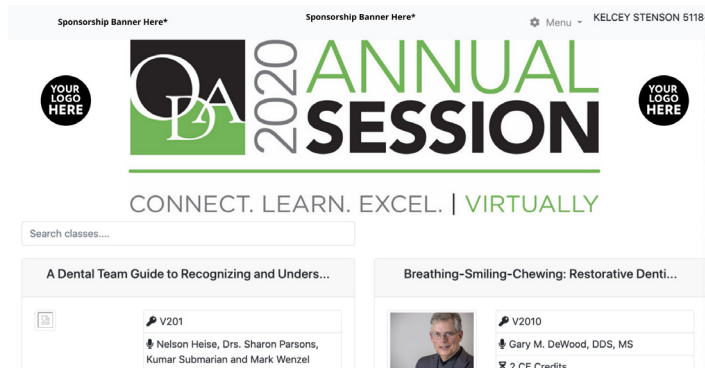
Sample Banner ad - CE Course Page